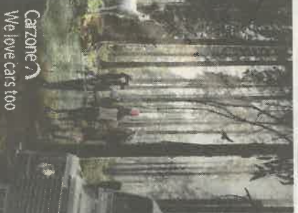
Cartell We love cars 100